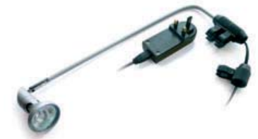
SPOTLIGHT - low voltage