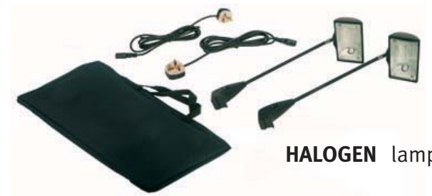
HALOGEN lamp kit